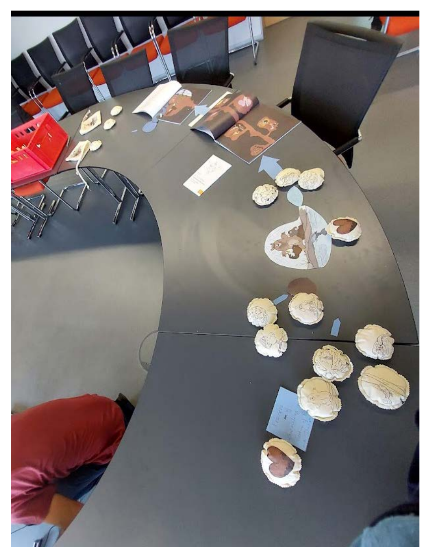
Figure 3. The co-created mindmap

and Salmon in this story all step outside their ecosystems (comfort zones) to look for knowledge and work together to create their common path. Rather than finding a singular answer to their learning quest, they arrive at a common multidisciplinary question. A recurring motif throughout the work is a spider spinning a web, encouraging researchers and pupils to consider connectivity.