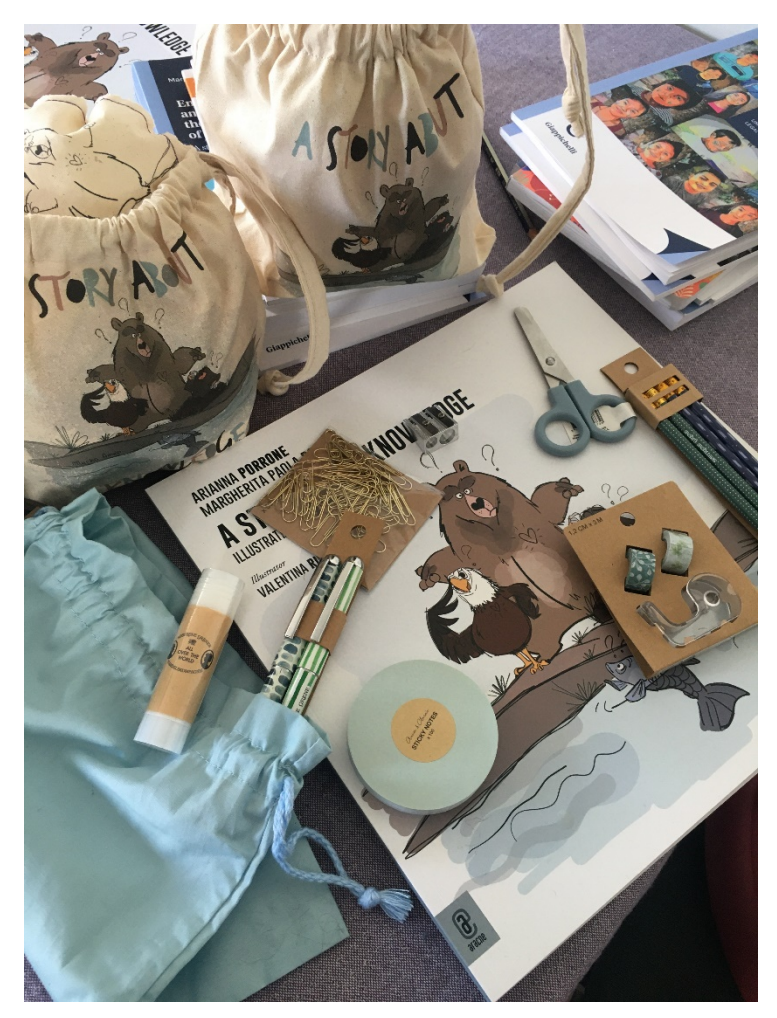
Figure 2. Story About Knowledge. Illustrated version, the prototype of the Touchbook, and some of the workshop tools.

As described by one of the participants, the result was a mixed media story, a multisensory experience that could be touched and felt through the stuffed characters and the book carvings, a journey, and a mind-map. What clearly emerged from the process was the need to remove barriers and obstacles to cohesively find knowledge. Searching, finding, and treasuring knowledge (in particular our green and blue spaces) requires cooperative, considerate, multi-species work. In this endeavour, one needs to remove barriers and pre-conceptions, become humble, and "dig" for answers. Sometimes, knowledge can only be found in cooperation with others. This phenomenon is demonstrated in our learning experience through the case of a Salmon who needs the intuition and wisdom of a Mole to find it (knowledge) within the heart of the (h)earth. This exercise is designed to teach all ages that the learning process is not flawless. Rather, it flows imperfectly as the oceans' waves. The intrinsic motivation to search for imperfect knowledge (i.e develop a research question) is passion. The search for knowledge is ultimately an act of love that requires courage, the ability to explore other research environments, and actively listening and supporting others' talents. The Mole, Eagle, Bear